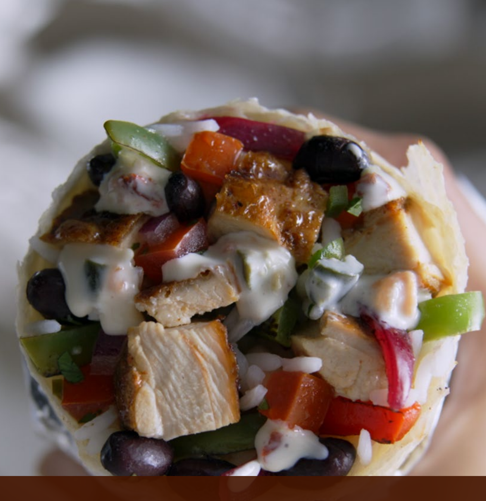
THE "KEEPING IT REAL" TEST